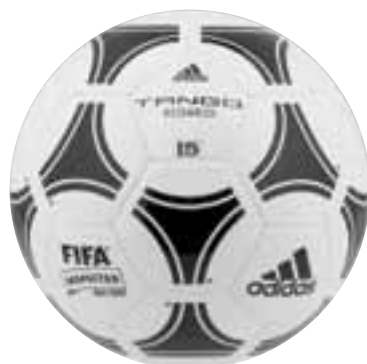
656927 White/Black Black