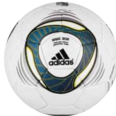
V42338 White/Fresh Splash/Acid Buzz