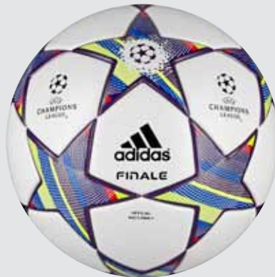
V87371 White / Ultra Lilac Metallic