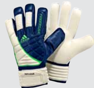
V42279 New Navy/White/Macaw