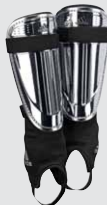
V87521 Metallic Silver/ Black