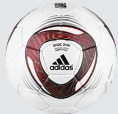
V42356 White / University Red/Black