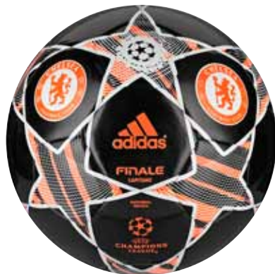
V87031 Black Warning/White