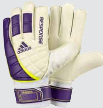
V87193 White/Sharp Purple/Electricity