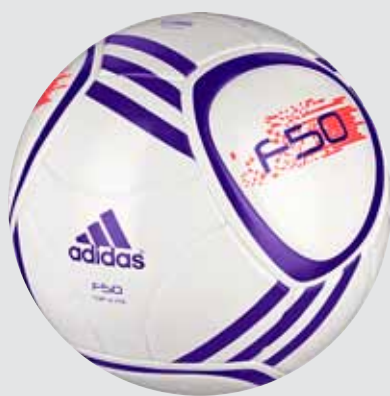
V87202 White /Ultra Lilac Met./ Infrared