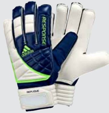
V42270 New Navy/White/Macaw