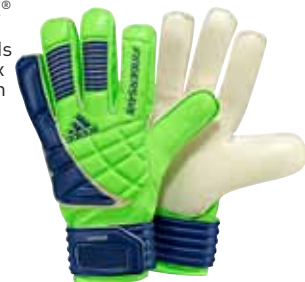
V42277 Macaw/New Navy/White