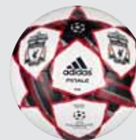
V87026 White / Light Scarlet/Solid Grey