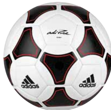
V42361 White/Black/ Light Scarlet