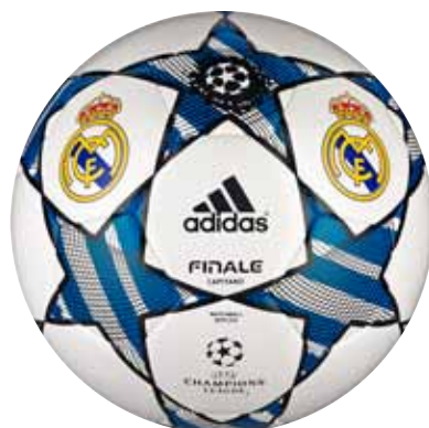
V87035 White/ Drk.Marine/Shp.Blue