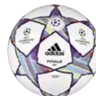
V87059 White / Ultra Lilac Metallic