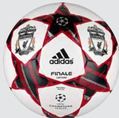
V87028 White / Light Scarlet/Solid Grey