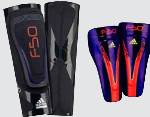
V87179 Anodized Purple / Infared / White