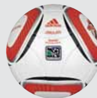
V00787 White / Poppy Dark Shale