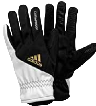
V42284 Black/White/Metallic Gold