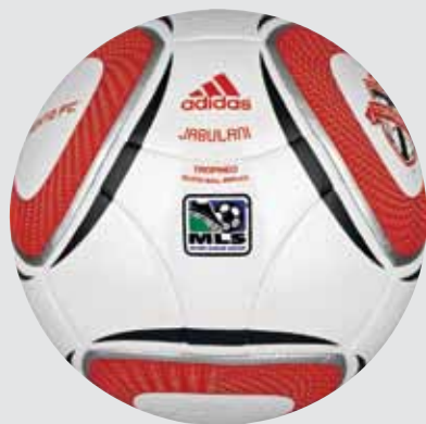
E42357 White / Poppy Dark Shale