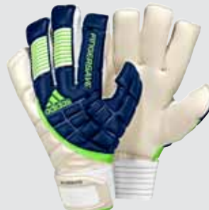
V42280 New Navy/White/Macaw