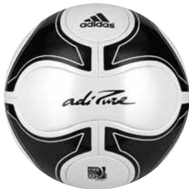
V42363 White/Black Dark Metallic