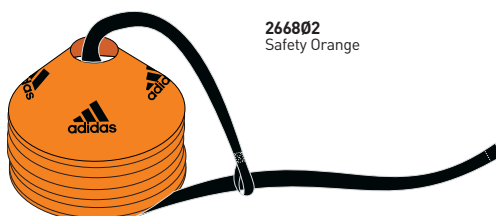
266802 Safety Orange