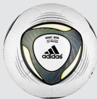
V42401 White / Back/ New Navy