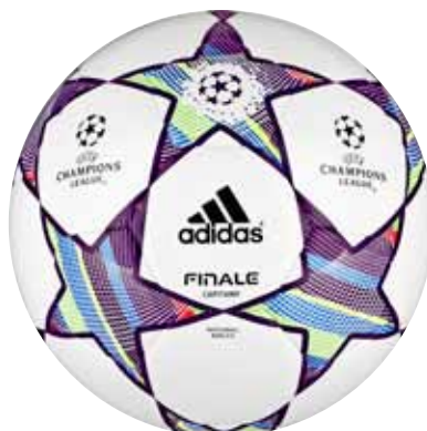
V87066 White / Ultra Lilac Metallic