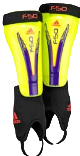
V87165 Electricity/Ultra ilac Met./ Infrared

Sizes: XS, S, M, L, XL MSRP: $30.00 TN1500Y