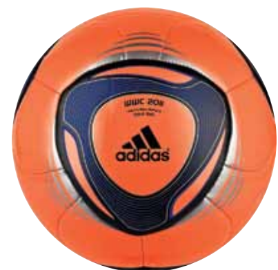
V42330 White/Black/ Cobalt