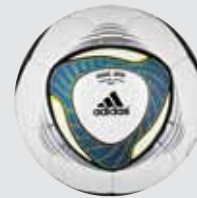
V42344 White / Fresh Splash/Acid Buzz S10