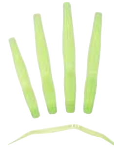
E41872 Acid Buzz

- FINGERSAVE® finger spines stiffen and resist pressure when pushed backward for effective ball deflection. - 100% thermoplastic polyurethane.