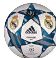
V87034 White/ Drk.Marine/Shp.Blue