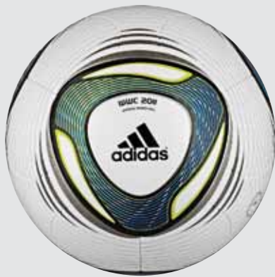
V42357 White / Fresh Splash/Acid Buzz S10