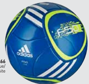
V87266 Sharp Blue/ Slime/ White