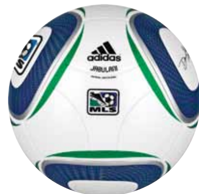
E42373 White / Cobalt/ Fairway