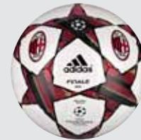
V87032 White / Black ACM Red/ Phantom