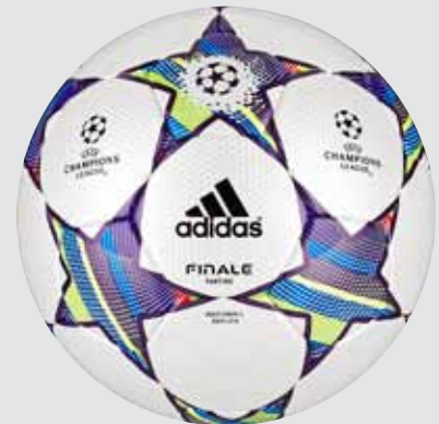
V87068 White / Ultra Lilac Metallic