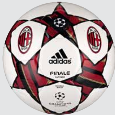
V87033 White / Black ACM Red/ Phantom