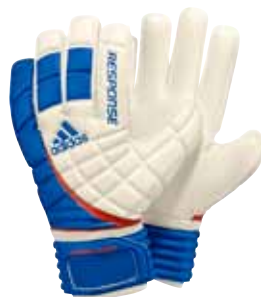
V42271 White/Fresh Blue/Dark Orange