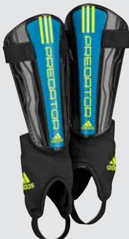
V87156 Black/Sharp Blue / Electricity

Sizes: XS, S, M, L, XL MSRP: $25.00 TN1250Y