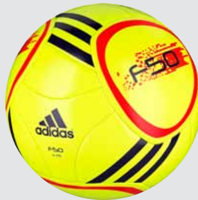
V87267 Electricity/ Infrared