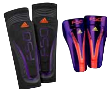
V87178 Sharp Purple/Infrared/ White

Sizes: XS, S, M, L, XL MSRP: $25.00 TN1250Y