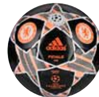
V87029 Black Warning/White