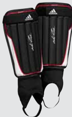
V42246 Black/White/Light Scarlet

Sizes: XS, S, M, L, XL MSRP: $30.00 TN1500Y