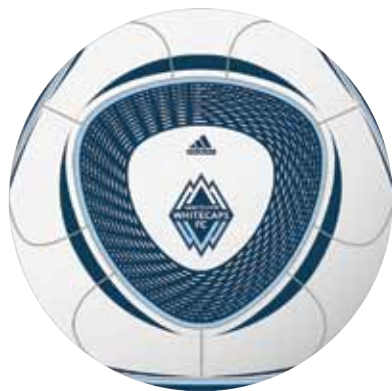
V87368 White / Deep Sea/Smoke Blue