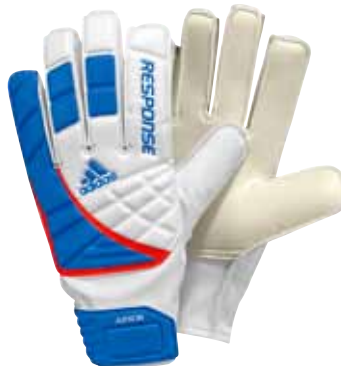
V42265 White/Fresh Blue/Dark Orange