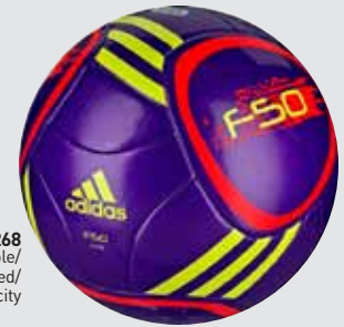
V87268 Sharp Purple/ Infrared/ Electricity