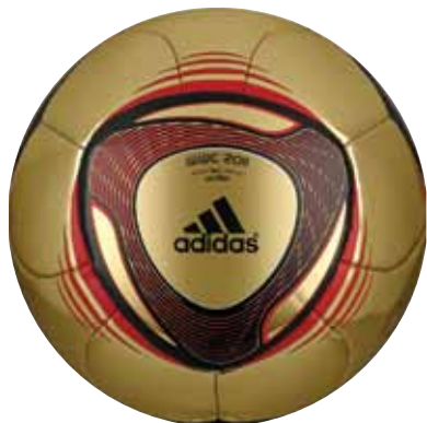
V42351 Metallic Gold / Black / Light Scarlet