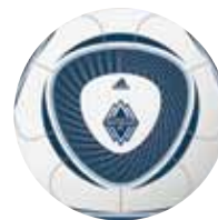
V87388 White / Deep Sea/Smoke Blue