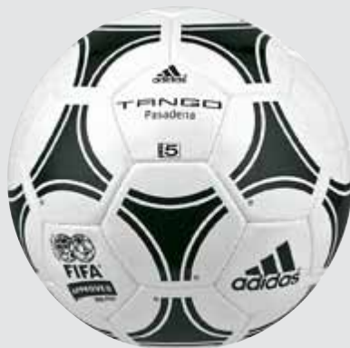
656940 White /Back/ Black