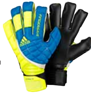
V87196 Sharp Blue/Electricity/Predator Red