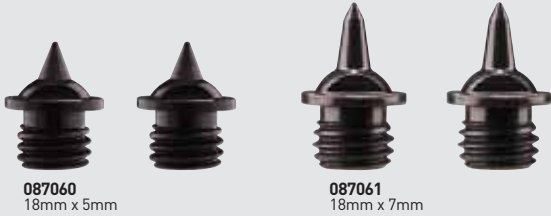
087060 18mm x 5mm

MSRP: $8.00 TN0400Y 18x5mm $9.00 TN0450Y 18x7mm